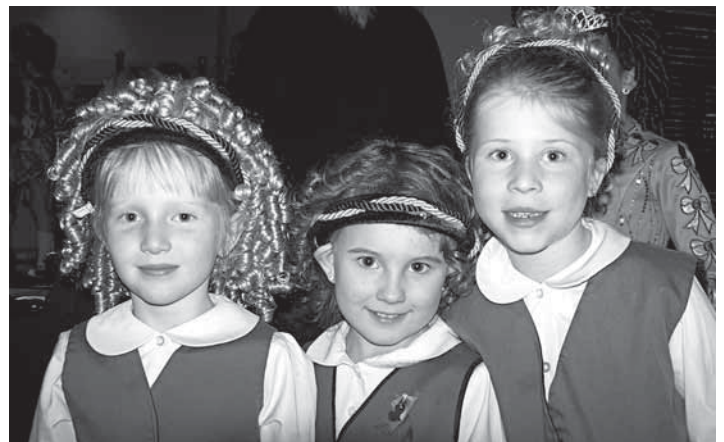
The Irish Dancers performed at Thursday's Banquet